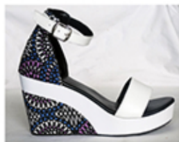
covered in fabric/leather