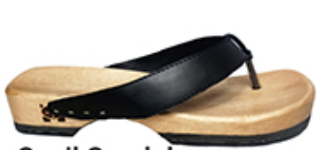
Cecil Sandal (ergonomic)