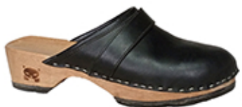
Cecil Closed (ergonomic)