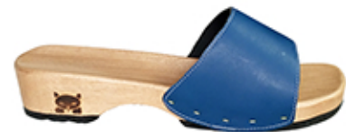
Cecil Band (ergonomic)