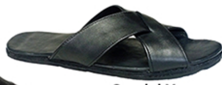
Sandal X made with recycled tires