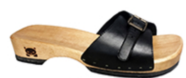
Cecil V5 (ergonomic)