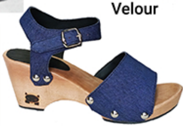
Venice Band Ankle