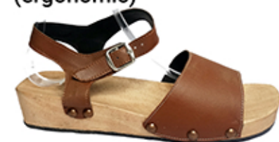
Cecil Wedge (ergonomic)