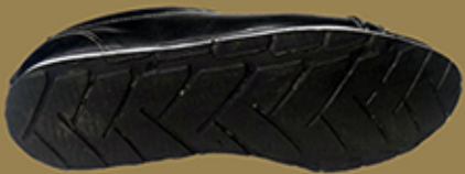
made with recycled tires