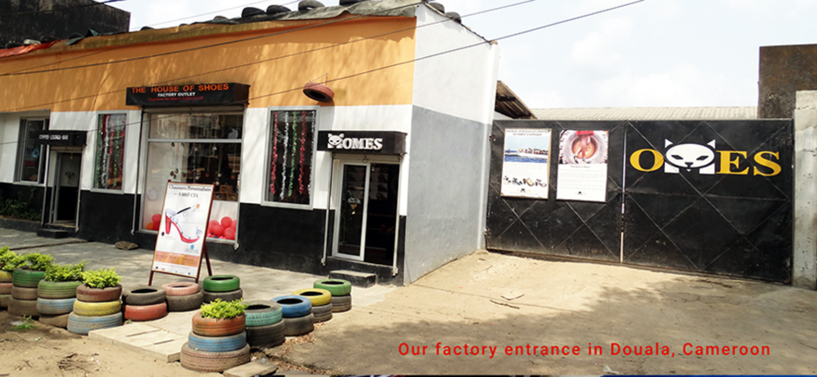
Our factory entrance in Douala, Cameroon