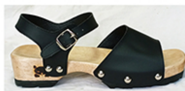
Cecil Ankle Band (ergonomic)